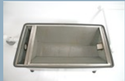
✓ Odor Tight Seal