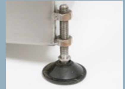
✓ Adjustable Tilting Feet