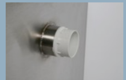
✓ Solvent Weld Fittings

Supplied & Distributed By Clearflow Environmental Technologies Ltd. Tel: 01325 460040