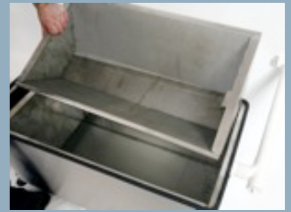
✓ Removable Food Filter

Engineered from rust-free 304 grade stainless steel in a sleek attractive design, which will blend in to any commercial kitchen.